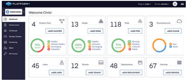
A comprehensive and intuitive dashboard

Decoupling apps from infrastructure, Platform9 delivers a better experience for developers — apps can be deployed against consistent open-source APIs such as Kubernetes and CNCF services.